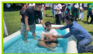
South Park Baptisms