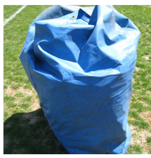
Step 9-10: Place in Bag while Inflatable is "Standing".