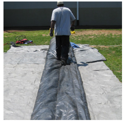
Step 2-6: Fold the Inflatable in 2-3 feet lengthwise and walk out air towards Ports (Blower tubes).