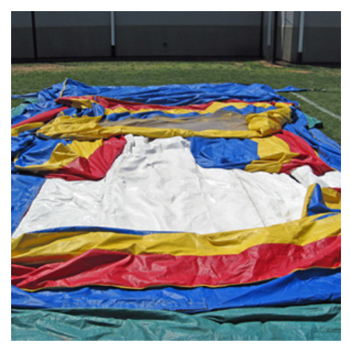
Step 1: Fold Material neatly towards middle.