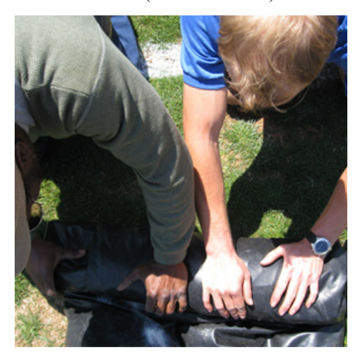
Step 8: Roll tight, keep the roll lined up and tuck in any extra material.