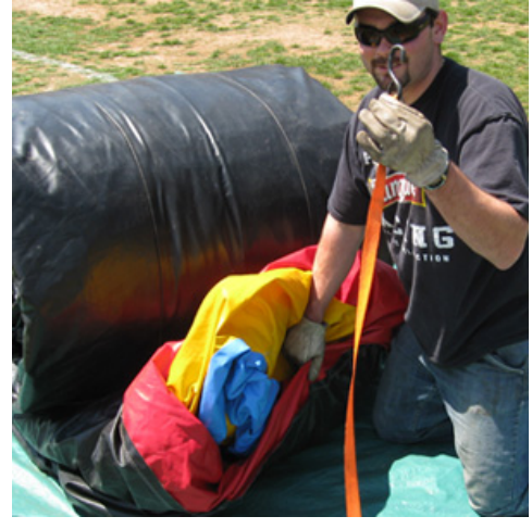
Step 7: Tuck in rope or strap 2-3 feet underneath Inflatable before roll is complete.