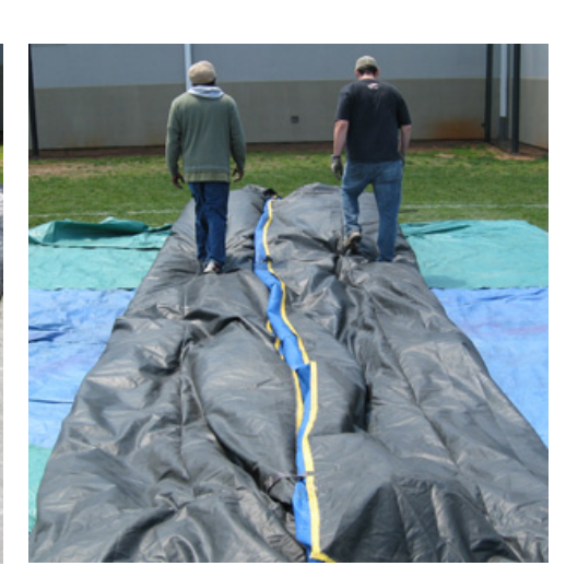
Step 2-6: Fold the Inflatable in 2-3 feet lengthwise & walk out air towards Ports (Blower tubes).