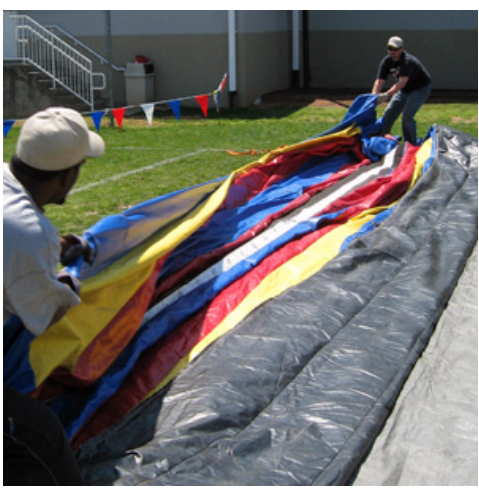
Step 2-6: Fold the Inflatable in 2-3 feet lengthwise.