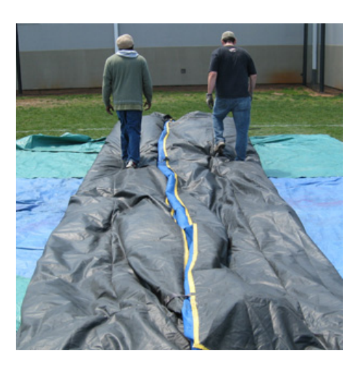
Step 2-6: Fold the Inflatable in 2-3 feet lengthwise & walk out air towards Ports (Blower tubes).