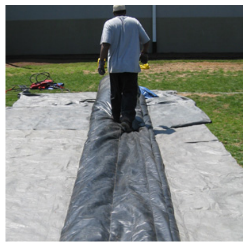
Step 2-6: Fold the Inflatable in 2-3 feet lengthwise and walk out air towards Ports (Blower tubes).