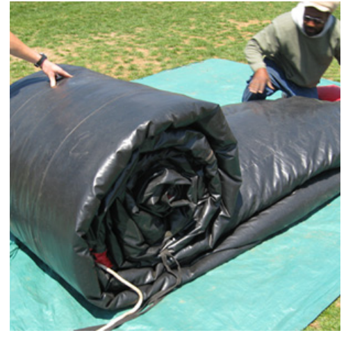
Step 9-10: Tuck in Ports (Blower tubes) and tie off roll.