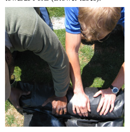
Step 8: Roll tight, keep the roll lined up and tuck in any extra material.