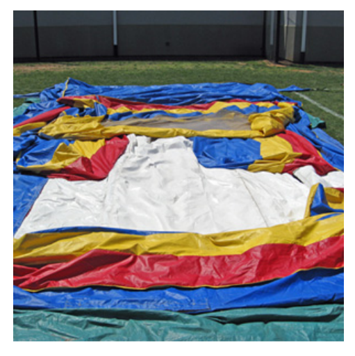
Step 1: Fold Material neatly towards middle.