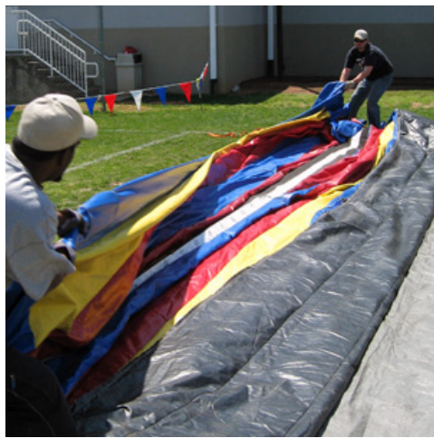
Step 2-6: Fold the Inflatable in 2-3 feet lengthwise.