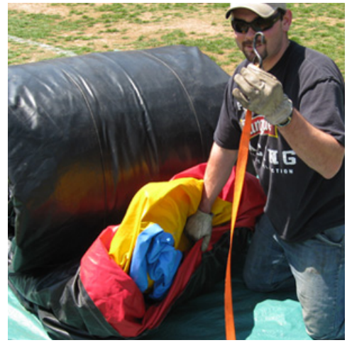
Step 7: Tuck in rope or strap 2-3 feet underneath Inflatable before roll is complete.